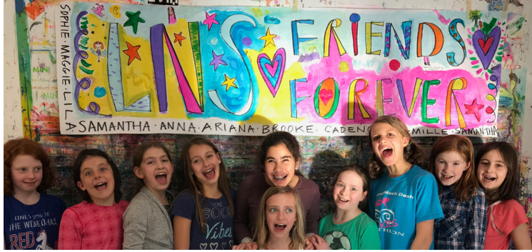
Friends forever: Alums from 2011-2013 gather at Beehive Art Studio and share memories of LNS.